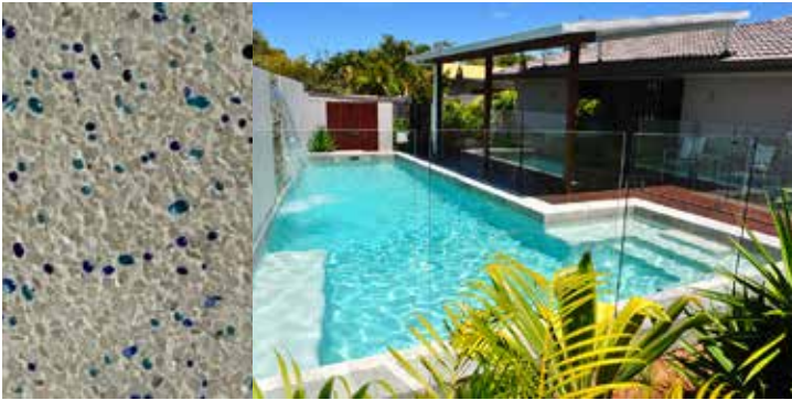
Pool Fab Azure