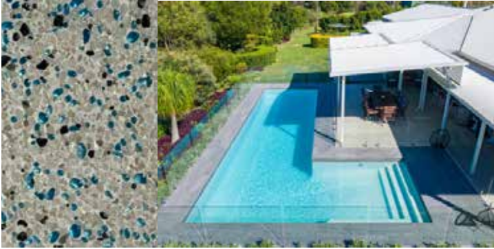
Pool Fab Aqua