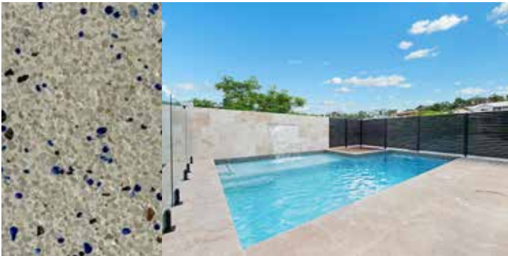
Pool Fab Sky