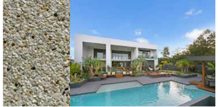
Pool Fab Champagne