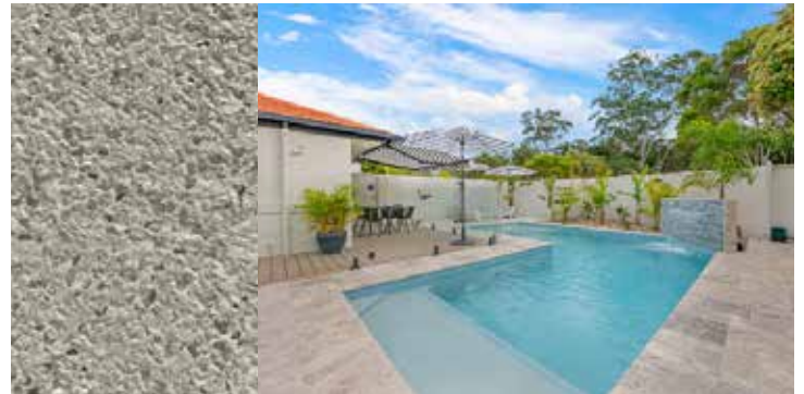
Pool Fab White

Please note: These pictures are indicative examples only of the water colours provided. The final water colour of each project will vary with the final tile choices and surrounding environment.